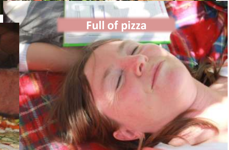
Full of pizza