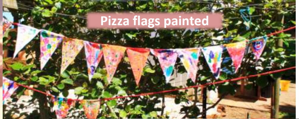
Pizza flags painted