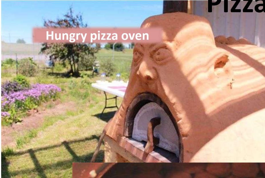
Hungry pizza oven