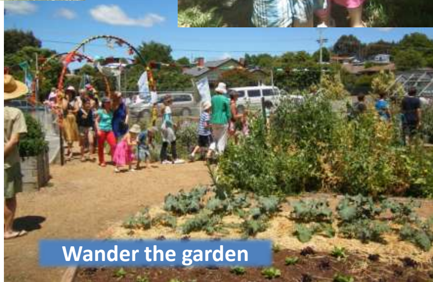
Wander the garden